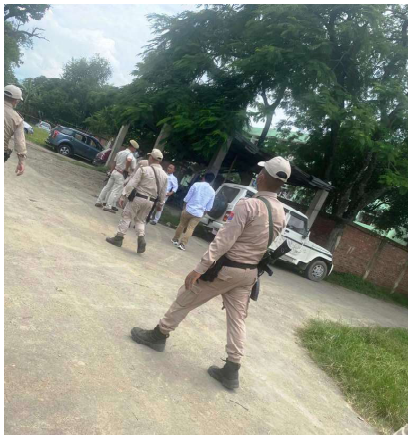
ATSUM leaders picked up by Police

ATSUM supported by other tribal bodies an-